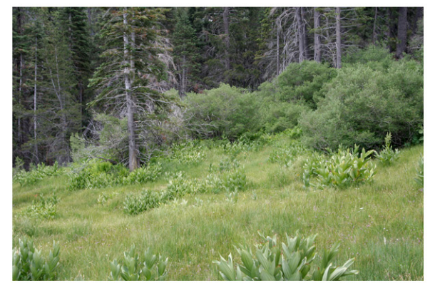
Herbaceous understory of riparian forest