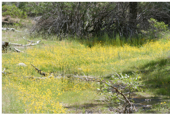
Vernally wet understory adjacent to Pinus jeffreyi forest