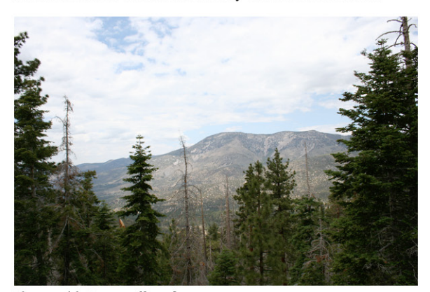
Slopes with Pinus jeffreyi forest