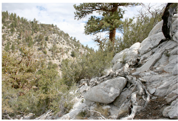
Carbonate soils in montane chapparal