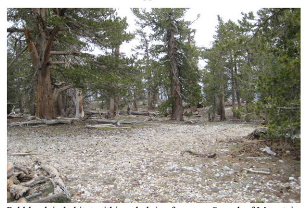
Pebble plain habitat within subalpine forest on Sugarloaf Mountain