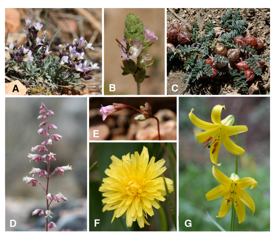
Figure 6: Select special status species occuring in the study area.