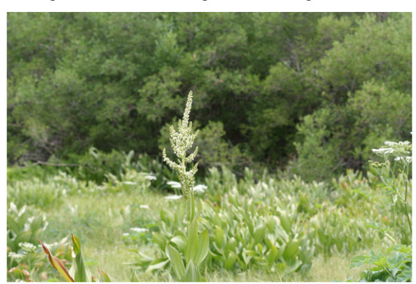
Montane meadow with clay soils surrounded by Salix