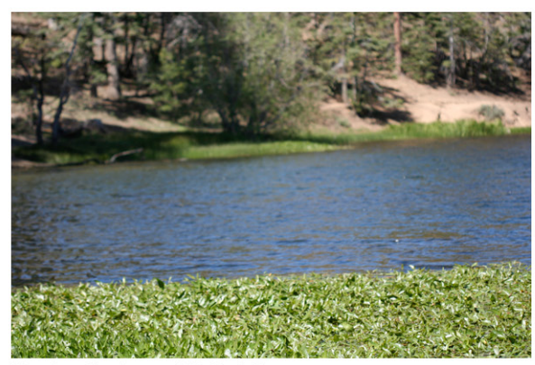
Marsh wetland around Jenks Lake