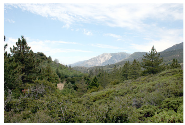
Chamise chapparal with Pinus coulteri interspersed