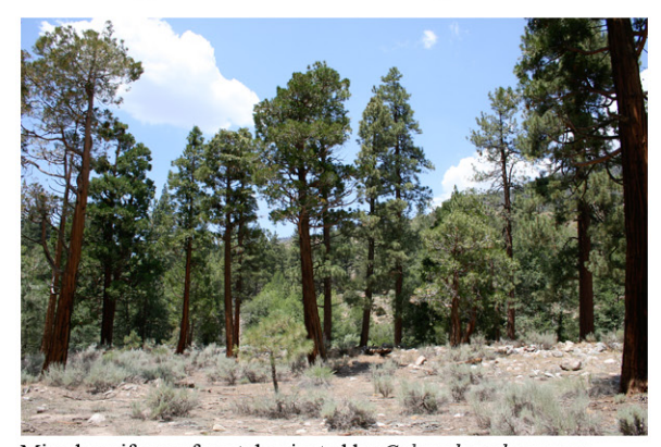
Mixed coniferous forest dominated by Calocedrus deccurens